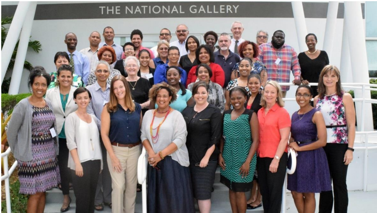
Participants 35 of the two day Key Stakeholders' Workshop.